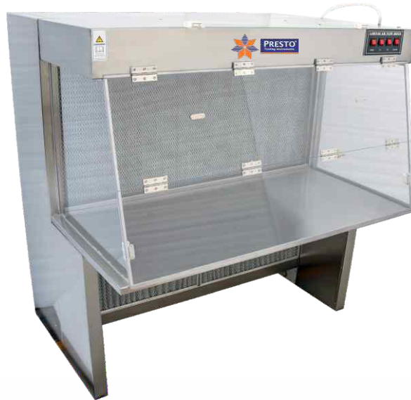
Model No. PLAFB-0124

Laminar Air Flow Bench is a consistent tool provided with an HEPA - filtered work area which is essential to maintain dust particles and bacteria free clean air environment. The instrument is widely used in testing laboratories to maintain clean work area that provide protection and safety measures from outside harmful contaminants.